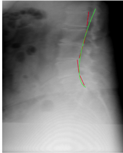
2: Side View of Your Low Back on 6/12/2017